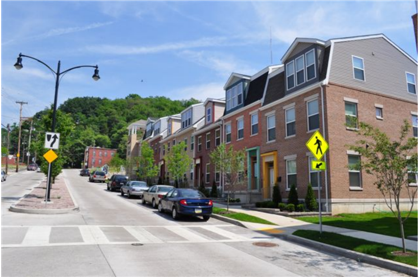
Federal Hill post construction