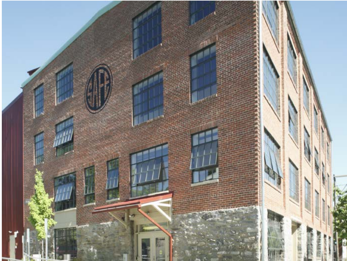
Dial Apartments, post renovation