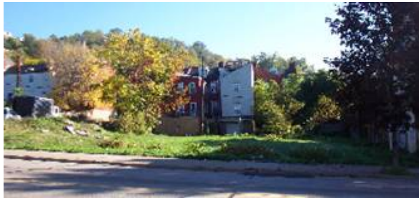
23-G-18-23 Vacant Land City of Pittsburgh URA