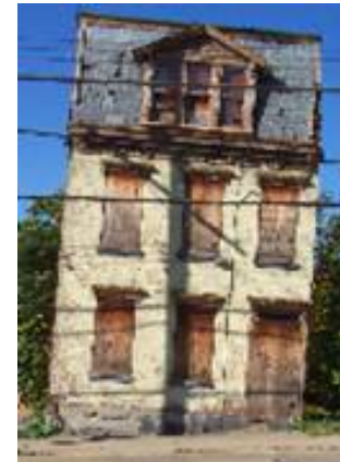
23-G-378 1501 Federal St City of Pittsburgh