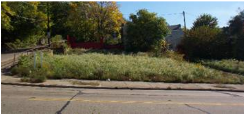
23-G-28, 29, 32, 36 1500-1514 Federal St