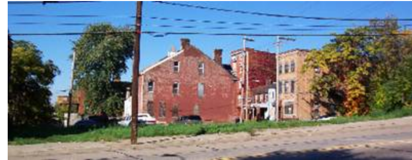
23-G-1-5 1500-1514 Federal