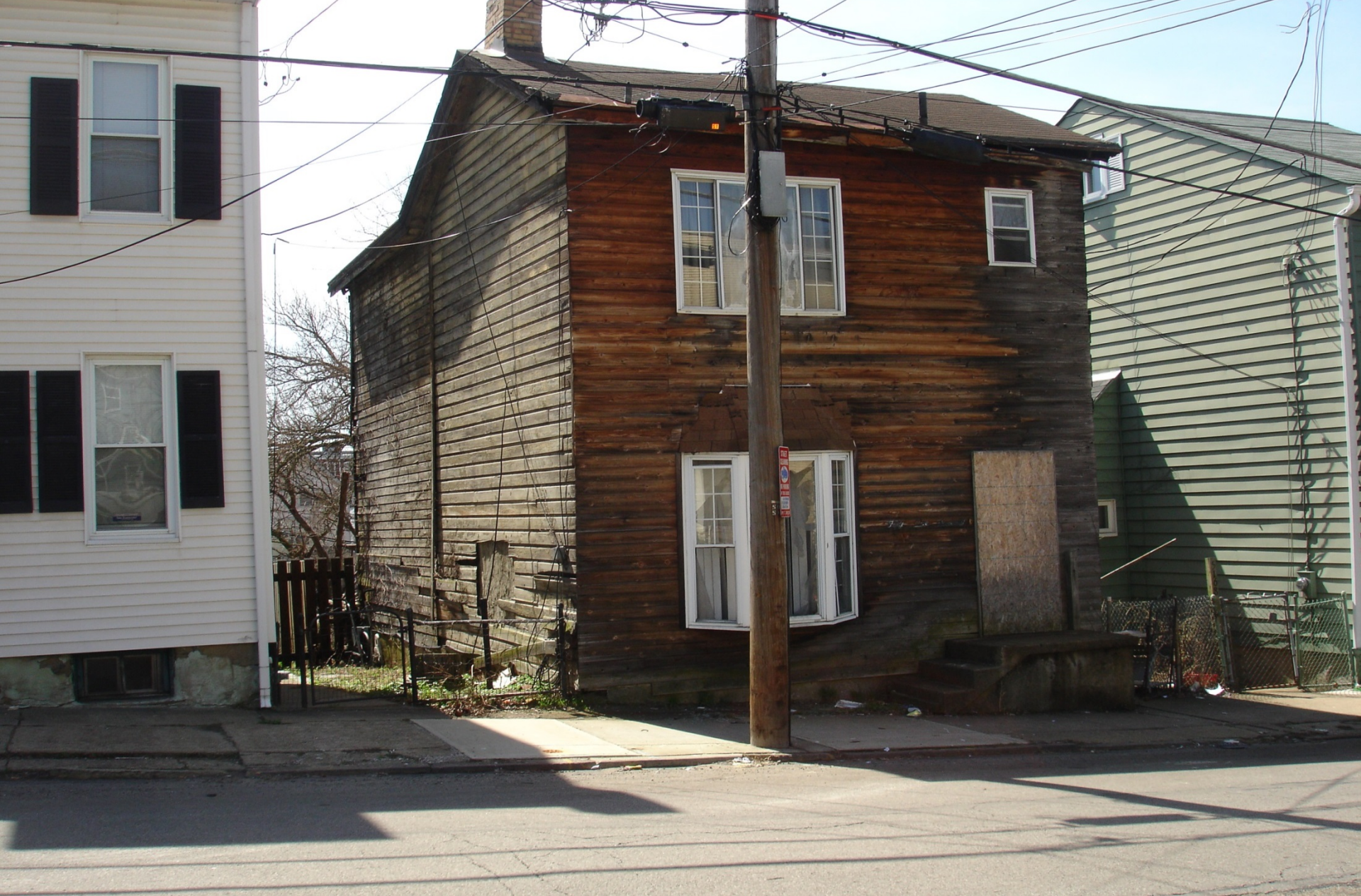
Garfield Glen pre construction