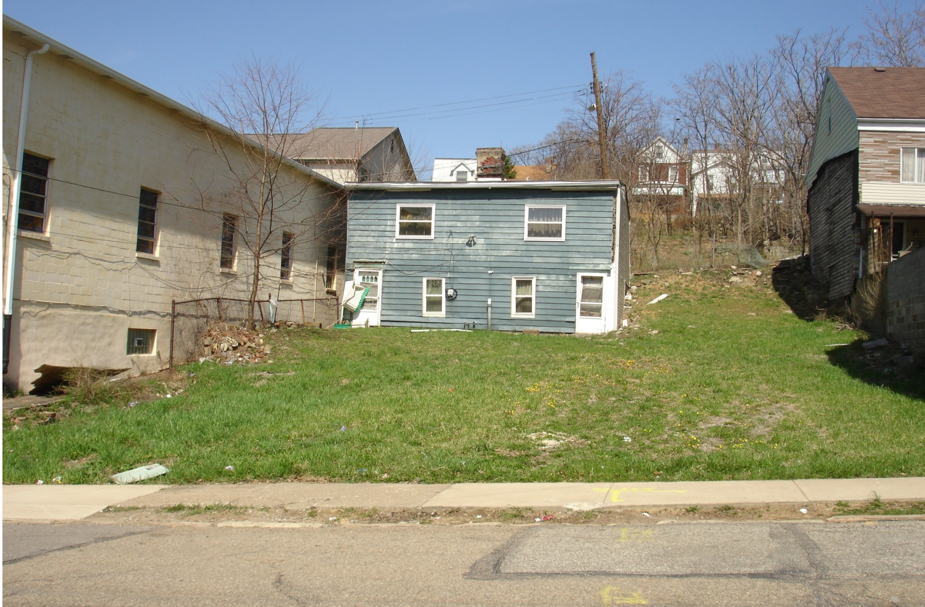
Garfield Glen, pre construction