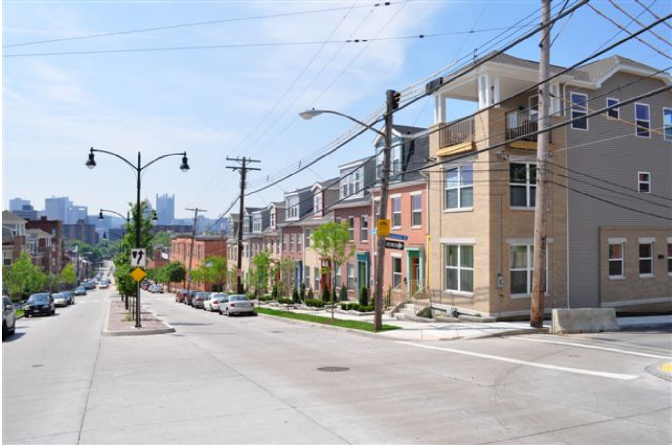
Federal Hill post construction