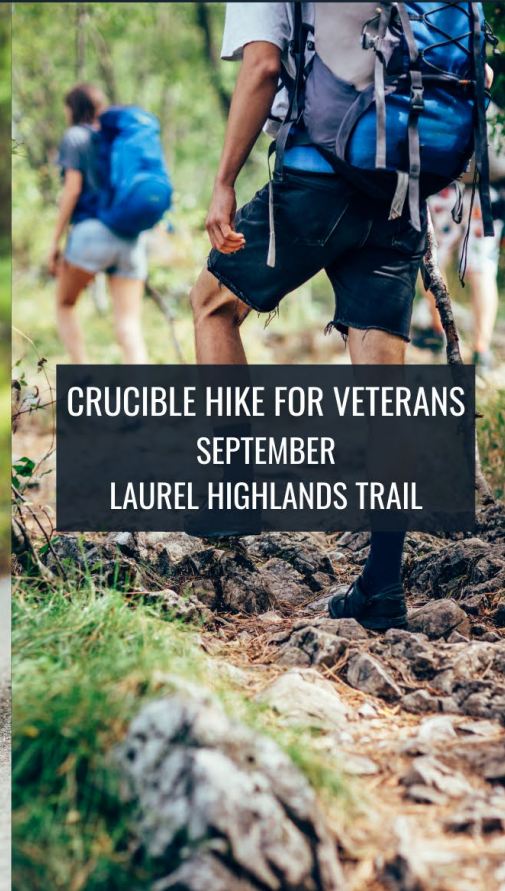
CRUCIBLE HIKE FOR VETERANS SEPTEMBER LAUREL HIGHLANDS TRAIL