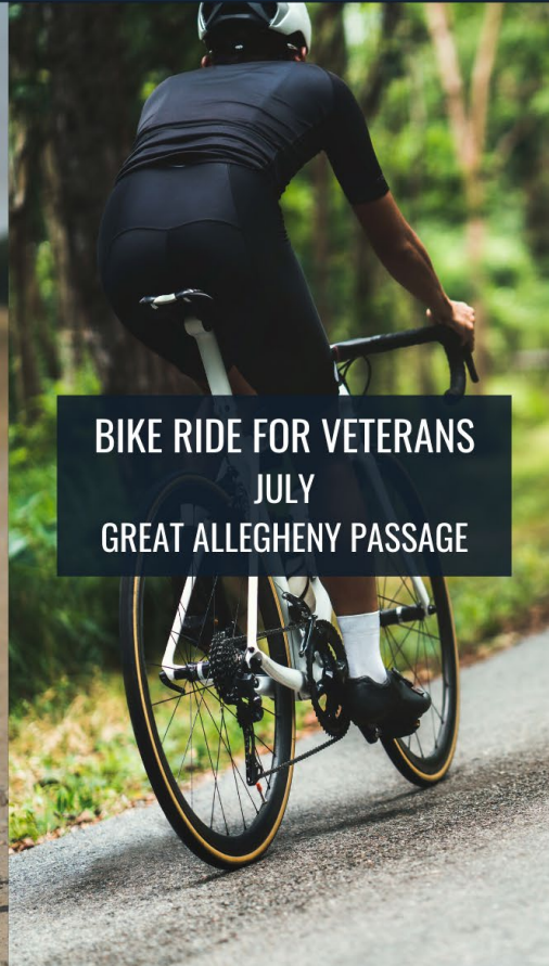
BIKE RIDE FOR VETERANS JULY GREAT ALLEGHENY PASSAGE