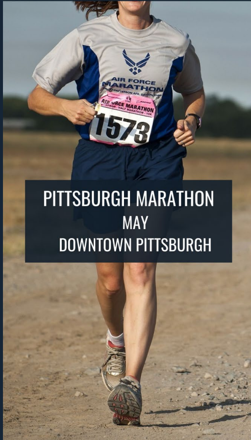
PITTSBURGH MARATHON MAY DOWNTOWN PITTSBURGH